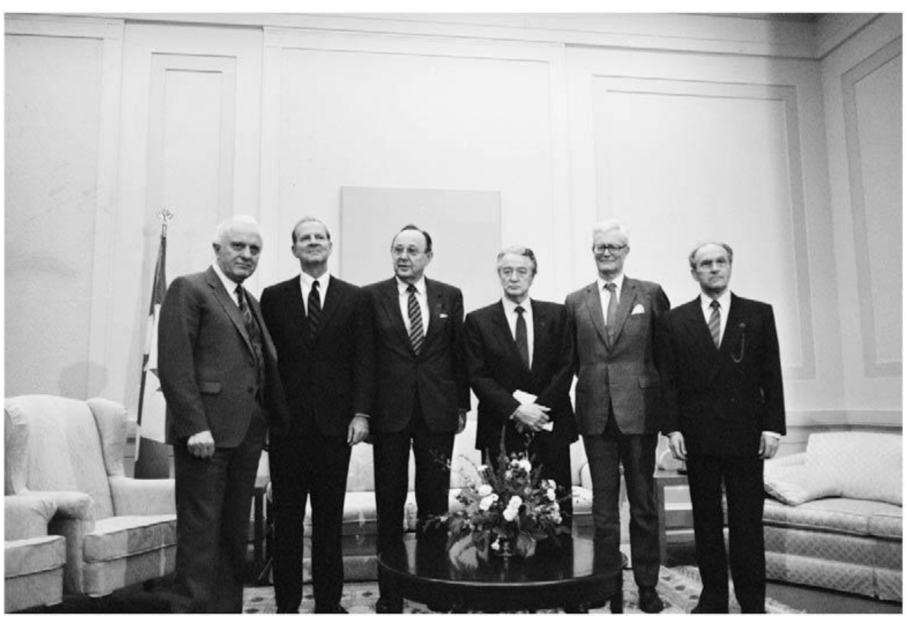
Shevardnadze (USSR), Douglas Hurd (Great Britain), and James Baker (USA) sign the so-called Two Plus Four Agreement (Treaty on the Final Settlement with Respect to Germany) in Moscow on September 12, 1990.